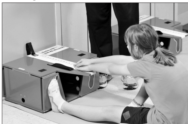
Figure 16. Back-Saver Sit and Reach