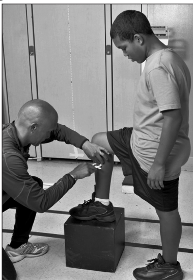
Figure 6. Skinfold Measurements

The equations used for estimating body fat for Skinfold Measurements are provided in Figure 7. The PFT data collection requirements, including the acceptable values, for Skinfold Measurements are shown in Table 5. The HFZs that apply to the Skinfold Measurement estimates of the percentage of body fat are shown in Table 7.