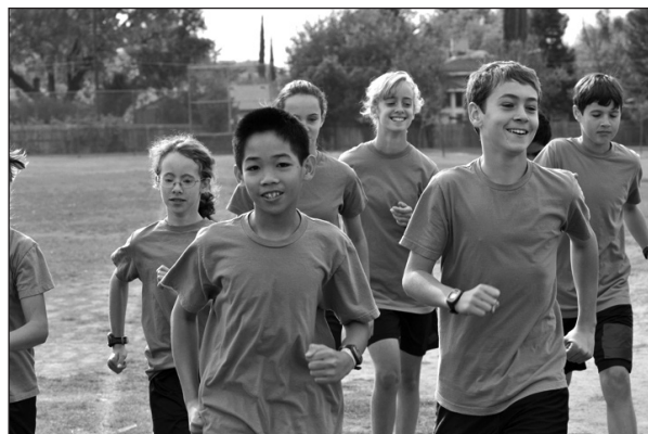
Figure 4. Walk Test

Walk Test. The Walk Test (Figure 4) is only for use with students who are ages 13 or older. This test estimates aerobic capacity from heart rate response to a one-mile walk. Students are instructed to walk one mile as fast as possible. Immediately after the walk, the heart rate is determined. This heart rate (heart beats per minute) is used along with the total walk time (minutes and seconds) and the weight of the student to estimate aerobic capacity. Students who do not finish the Walk Test should be given a time of 59 minutes and 59 seconds. For these students, this test will be scored Incomplete and reported as Needs Improvement.