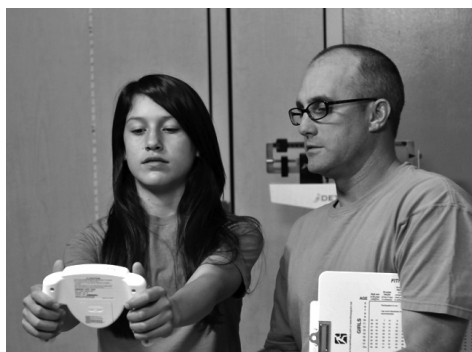
Figure 8. Bioelectric Impedance Analyzer

Bioelectric Impedance Analyzer (BIA). The BIA (Figure 8) measures resistance to the flow of an electrical signal in the body. The device sends a safe, low energy electrical signal through the body and generates an index of resistance. This resistance value is used by the device along with other values such as height, weight, age,