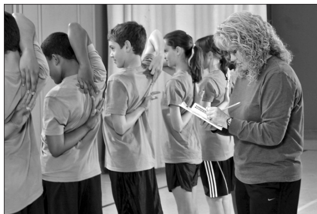
Figure 17. Shoulder Stretch