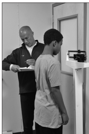
Table 8. (The height and weight data is also used in the estimation of \text{VO}_2\text{max} for the One-Mile Run and 20m PACER.) The HFZs that apply to the Body Mass Index are provided in Table 9.

The equation used for estimating Body Mass Index is provided in Figure 10. The PFT data collection requirements, including the acceptable values, for Body Mass Index are shown in