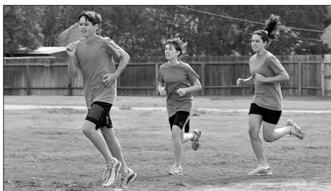
Figure 1. One-Mile Run

The equation used for estimating VO 2 max for the One-Mile Run is provided in Figure 2. The PFT data collection requirements, including the acceptable values, for the One-Mile Run are shown in Table 2.