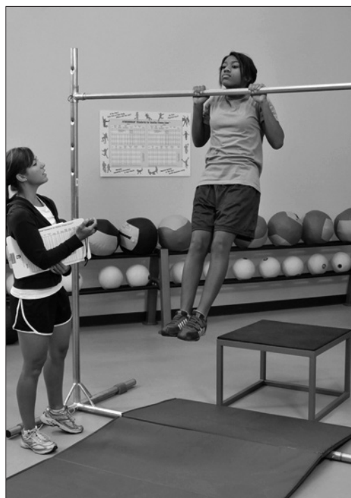
Table 18. PFT Data Collection Requirements for the Flexed-Arm Hang