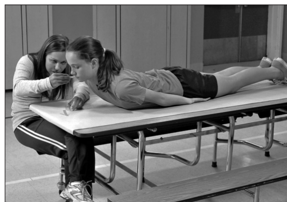
Figure 12. Trunk Lift

source of disability and discomfort in the United States. Although risks of developing back pain are greater with age, awareness and attention to trunk musculature at an early age is important to reduce future risks. The Trunk Lift (Figure 12) is the only test used to determine this area of fitness.