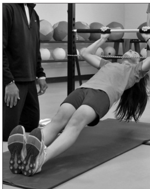
Figure 14. Modified Pull-Up

In the proper administration of the Modified Pull-Up, a student is allowed two form breaks with the first form break counting as a repetition. A student who commits two form breaks immediately after the start of the Modified Pull-Up should be scored 1.