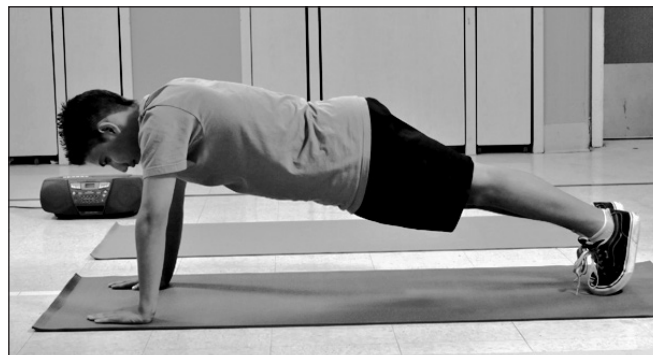
Figure 13. Push-Up

The PFT data collection requirements, including the acceptable values, for the Push-Up are shown in Table 14. The HFZs for the Push-Up are shown in Table 15.